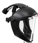
Grinding Hood RCA-3P